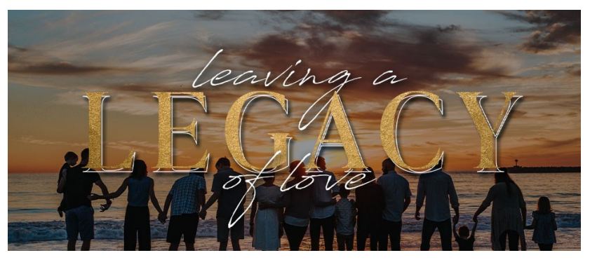
Financially Fit for The Future January 14 & 15, 2023